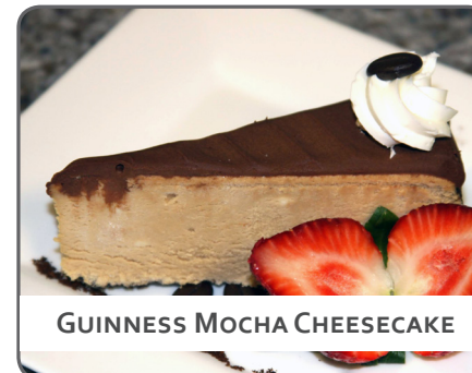
GUINNESS MOCHA CHEESECAKE

Chocolate & Coffee Cheesecake baked in a chocolate cookie crust. Topped with a Guinness Chocolate Ganache and whipped cream.