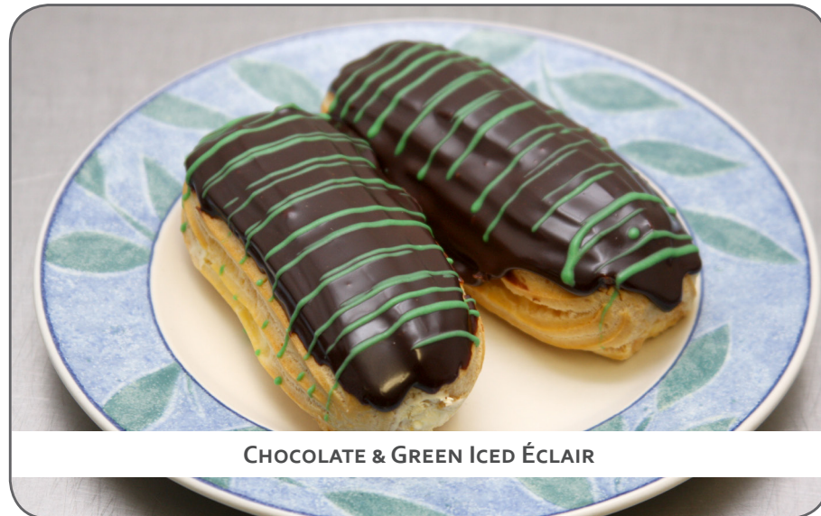
CHOCOLATE & GREEN ICED ÉCLAIR

3/18 • Products available while supplies last. Please place orders by Thursday, March 14th