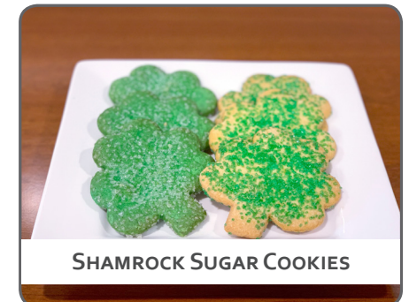
SHAMROCK SUGAR COOKIES